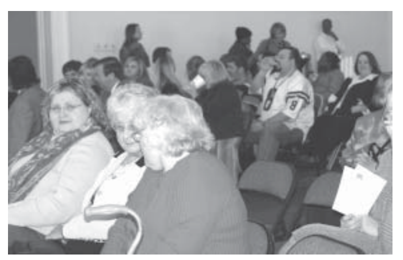
Over 150 guests, friends, and family members attended the 2006 Award Ceremony in Montgomery.