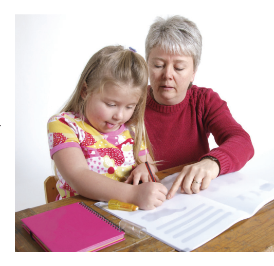
Before the IEP meeting keep a file or notebook of all of your child's educational records.

Keep a file or notebook of all of your child's educational records. Things to include: