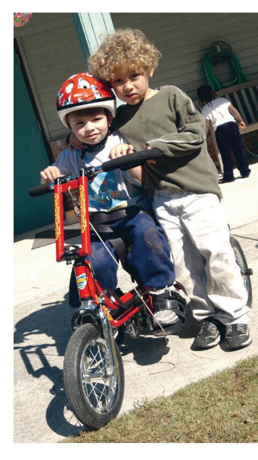
The IEP meeting must be held at a time and place agreeable to both you and the school.

A transition plan must include appropriate measurable post-high school training/education, employment, and community and independent living goals.