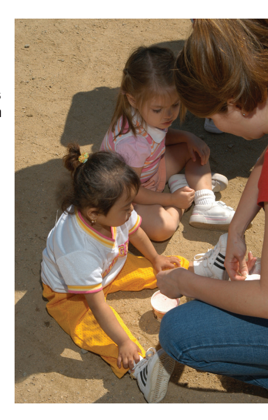
The IEP should cover all areas of development that affect your child's educational performance.

Annual goals must be reasonable - given your child's present levels of achievement, can she reasonably accomplish the goals in one year?